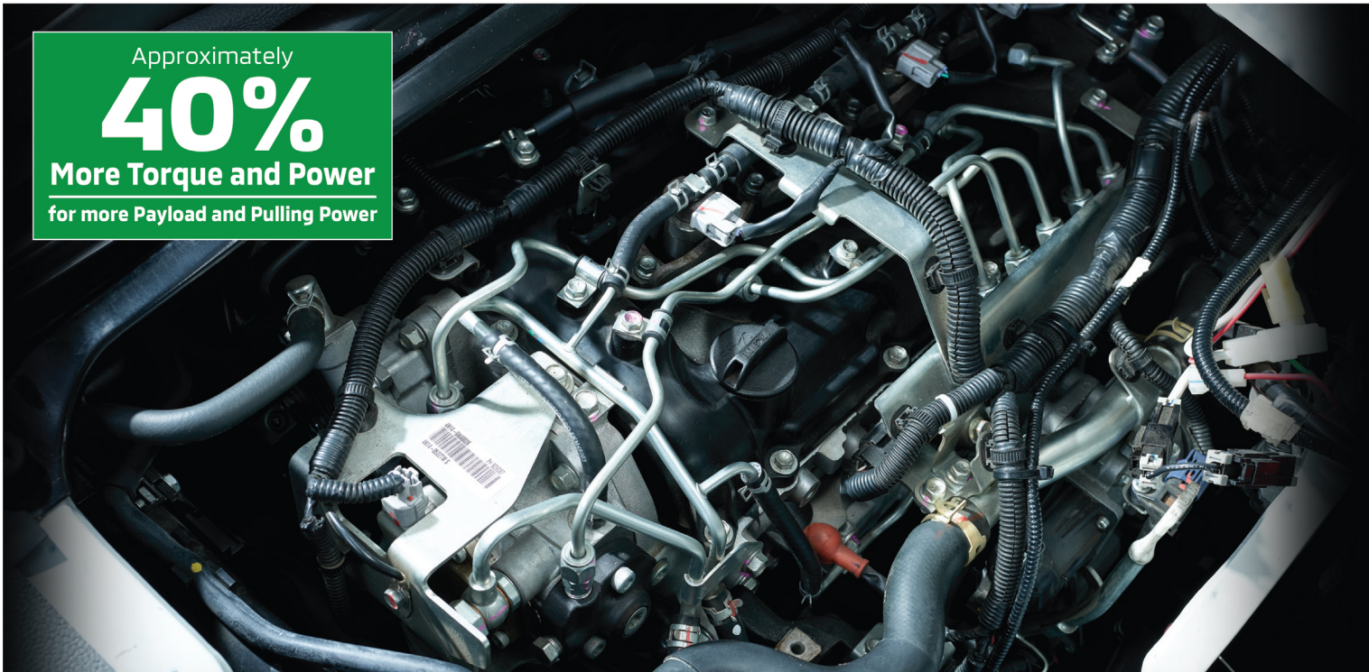
Euro 4-compliant 2.2L Turbocharged and Intercooled CRDi engine

Approximately 40% More Torque and Power for more Payload and Pulling Power